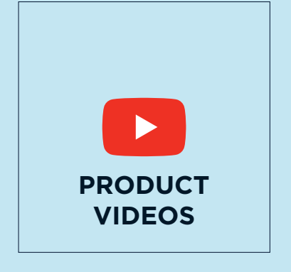
more tools & info